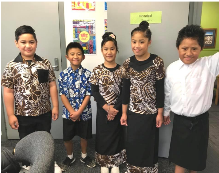
Samoa Language week pic

Due to illness Express Café are unable to supply lunches to our school on Mondays, Wednesdays and Friday. In the meantime Subway are filling in.